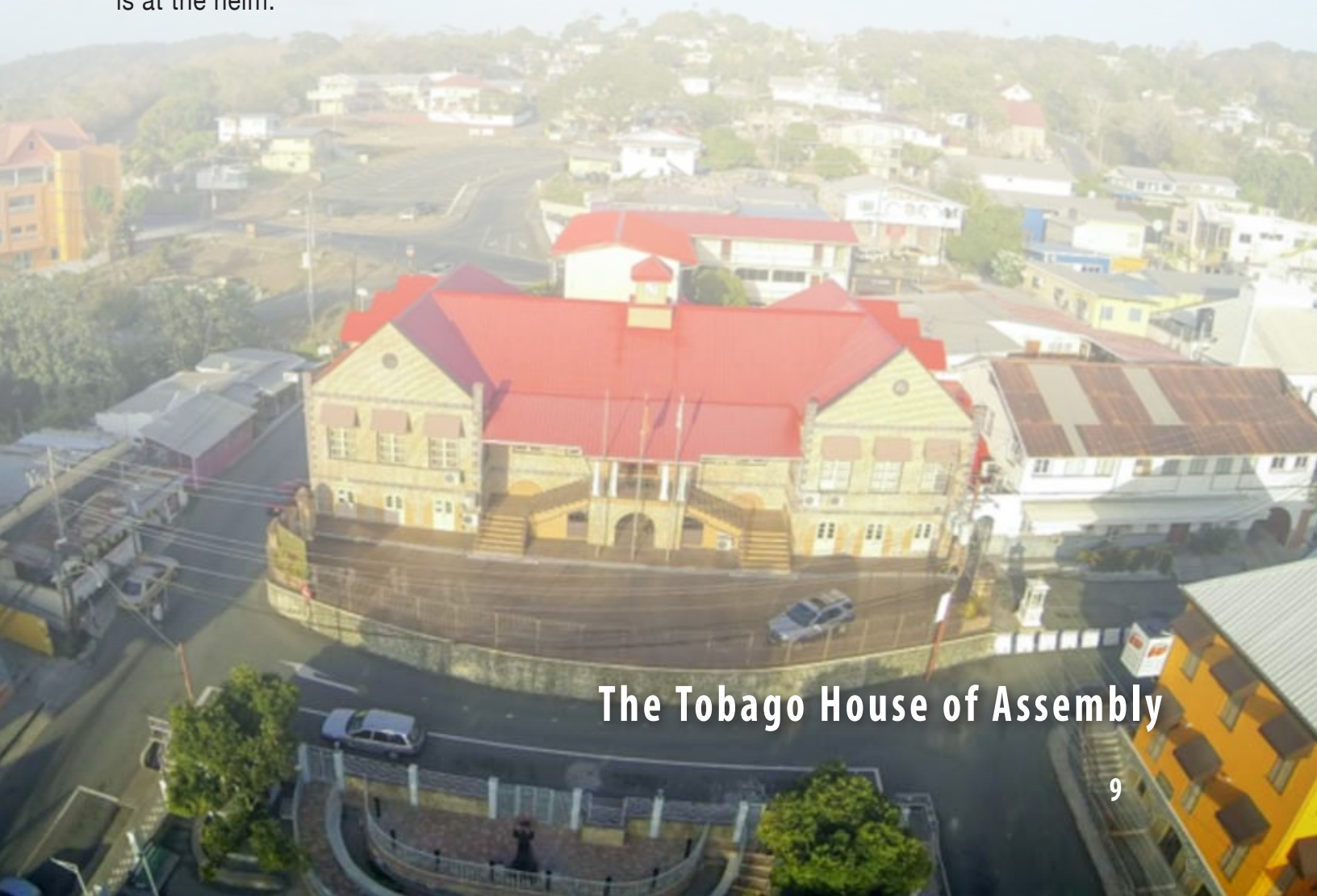
The Tobago House of Assembly

The modern THA has 12 seats, and unlike the original body, is open to any Trinbagonian residing in Tobago. After 1980, the THA formed itself into seven divisions each representing a developmental concern. Today the THA comprises two main arms: the Legislative Arm and the Executive Arm; along with 10 divisions including the Office of the Chief Secretary which is at the helm.