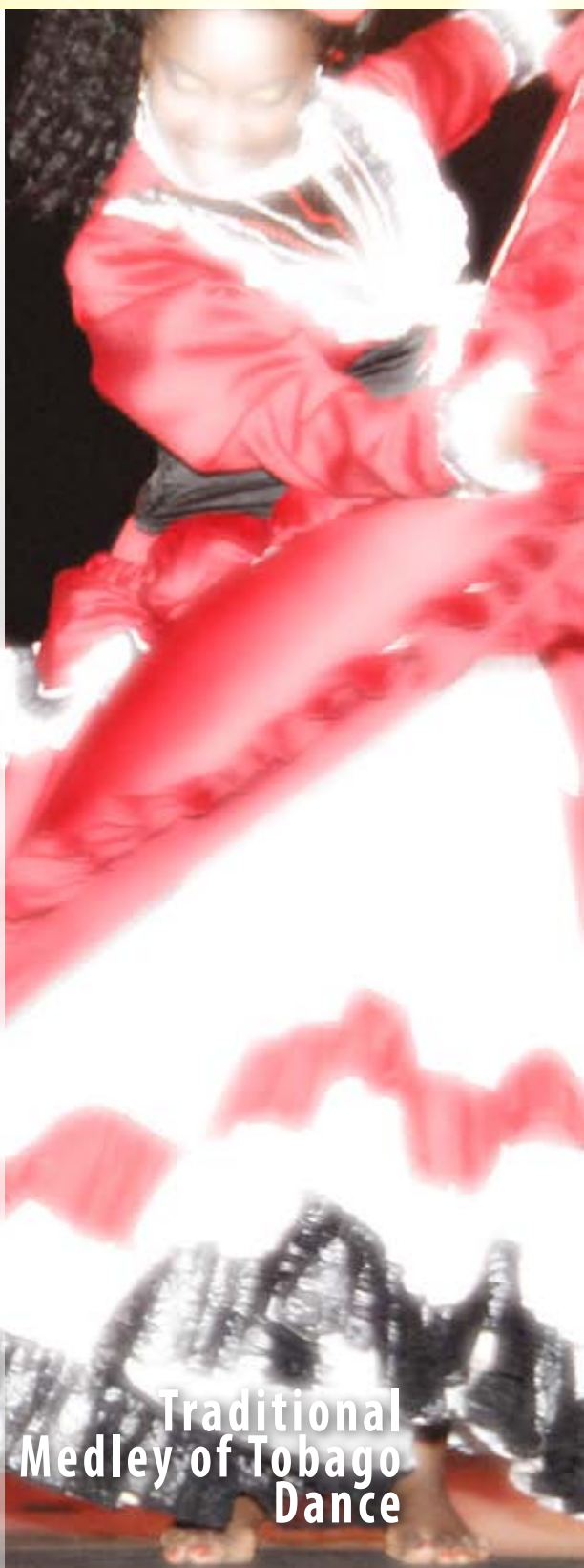
Traditional Medley of Tobago Dance