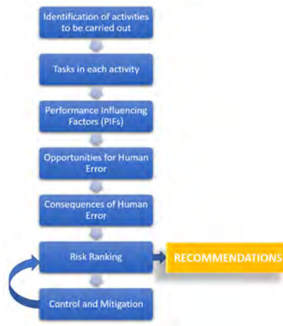
Figure 2. Steps to Evaluate Human Factors in Engineering Design